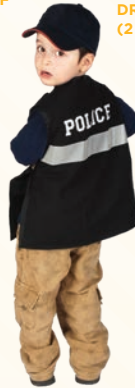
POLICEMAN DRESSING VEST (2 STYLES)