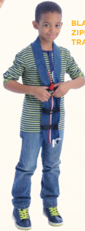
BLAST OFF ZIPPER TRAINER