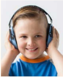
NOISE REDUCTION HEADPHONES