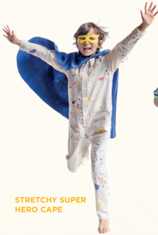
STRETCHY SUPER HERO CAPE