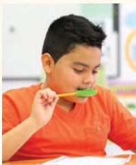
CHEWY PENCIL TOPPERS (5 STYLES)