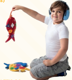
LET'S GO FINGER FISHING