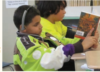
HAMILTONBUHL NOISE OFF