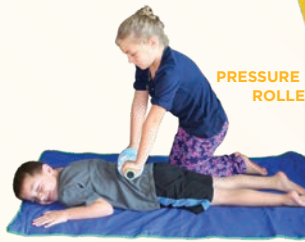
PRESSURE FOAM ROLLER